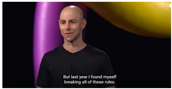
ADAM GRANT: HOW TO STOP LANGUISHING AND START FINDING FLOW